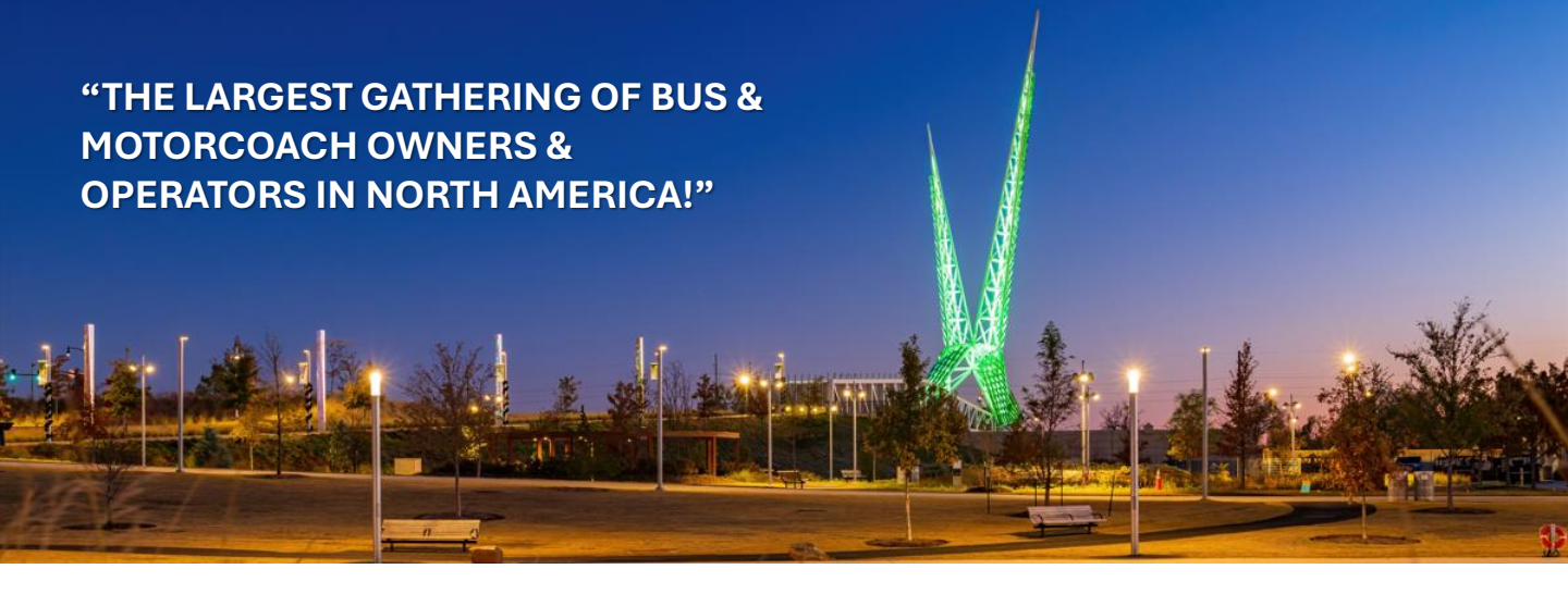
Exhibit at UMA Motorcoach EXPO and expand your industry relationships while you build your brand. Seeking and finding new opportunities with trusted business partners is at the top of their agendas. Companies are seeking new ways to solve challenges and approach business in 2025 and beyond.